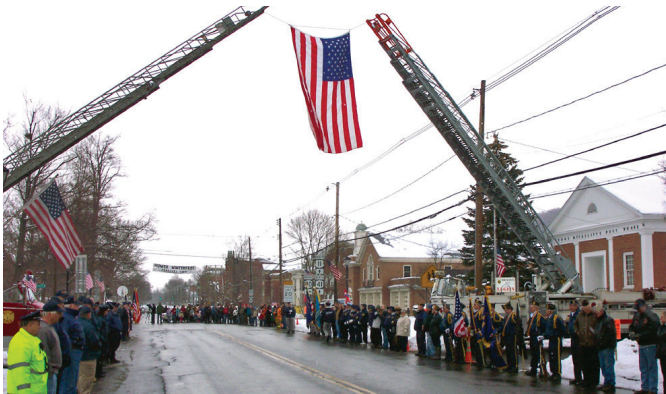
Coordinating patriotic community events is one way to keep your post visible.