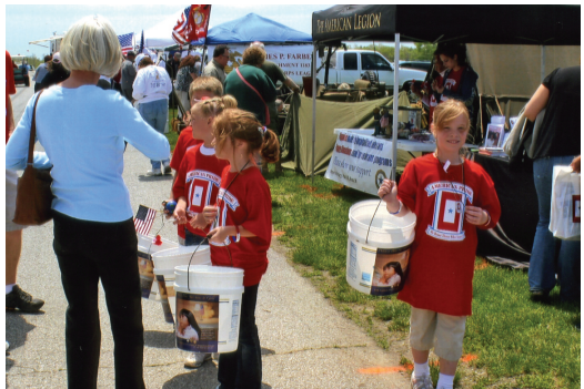
People of all ages can contribute to successful Legiontown events.

A partnership is a good idea when done with the media. For example, holding the event in conjunction with a local radio station will guarantee plenty of publicity (on that station) and most likely a live remote broadcast from the event, plus teasers on most of their shows for weeks prior to the event. In some cases, partnering with the local newspaper and a radio or television station is possible and increases coverage potential. As with sponsors, approach the publisher/station manager as far as possible in advance of the scheduled event. One year out is not too early.