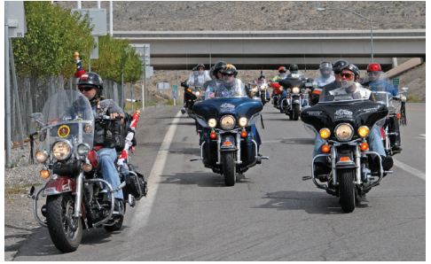
The American Legion Riders represent one of the fastest growing membership segments of the nation's largest veterans service organization.

Three months of community outreach to make your town a Legiontown will enhance your post's image and should significantly increase participation in your post's programs. Just as important, it will offer unlimited opportunities to invite those veterans that are your neighbors but not yet carrying an American Legion membership card to join the very best veterans organization in the community, state and nation. As your post holds and coordinates all these activities, take advantage of every opportunity to seek out and invite potential members to join. Be sure to give them the Legiontown, USA and Four Pillars booklets and answer their questions. Parents, teachers, first responders, business owners and employees, retirees and National Guard and Reserve troops will all see the advocacy and service of The American Legion during your Legiontown campaign and should be honored to carry the title of Legionnaire. Just ask them.